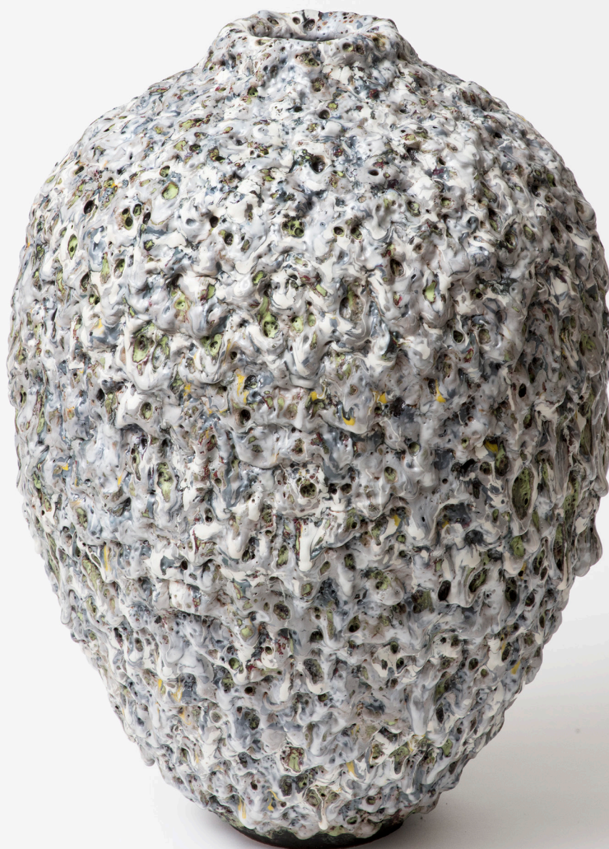
Moon Drop, 2018 Stoneware, glazes 55 x 45 x 45 cm / 21.6 x 17.7 x 17.7 in Unique