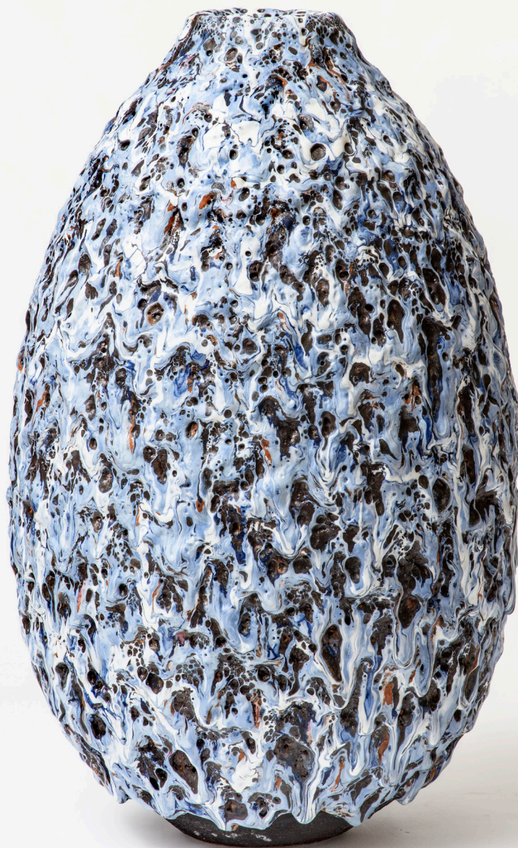
Moon Drop, 2018 Stoneware, glazes 65 x 38 x 38 cm / 21.6 x 17.7 x 17.7 in Unique