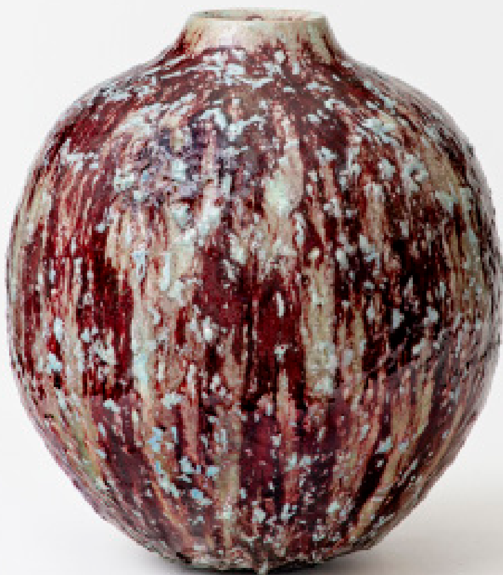
Moon Drop, 2018 Stoneware, glazes 55 x 45 x 45 cm / 21.6 x 17.7 x 17.7 in Unique