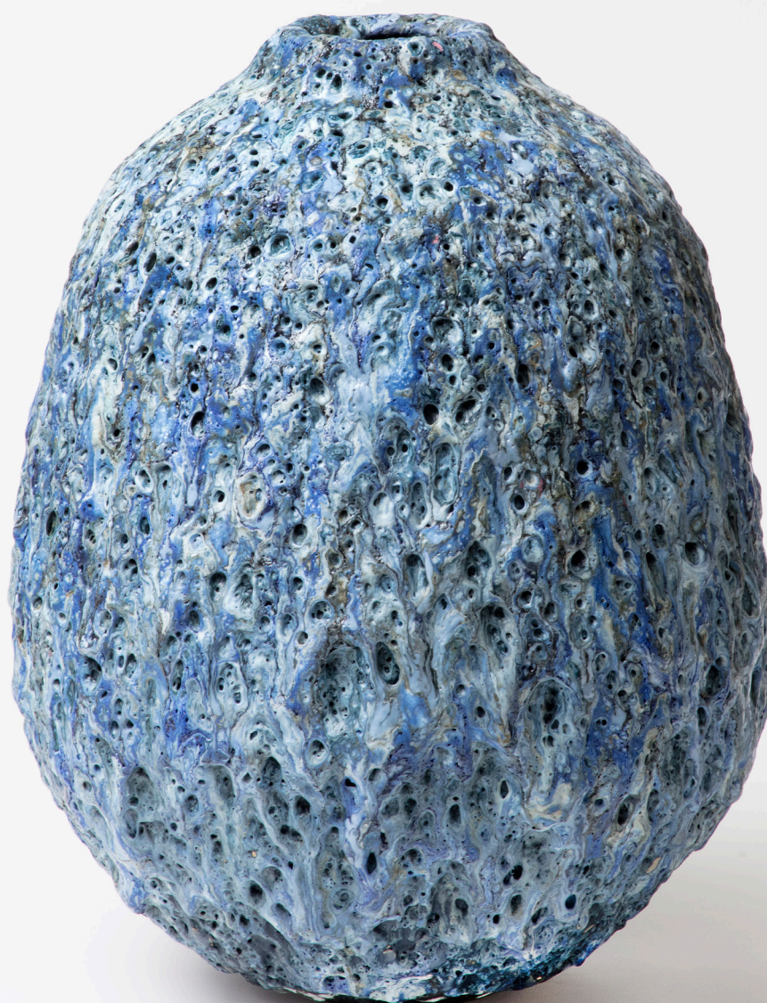
Moon Drop, 2018 Stoneware, glazes 55 x 45 x 45 cm / 21.6 x 17.7 x 17.7 in Unique