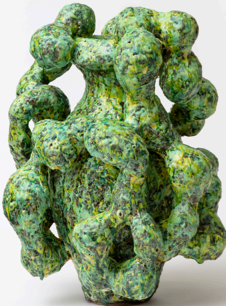
Horror Vacui, 2018 Stoneware, glazes 57 x 45 x 45 cm / 22.4 x 17.7 x 17.7 in Unique