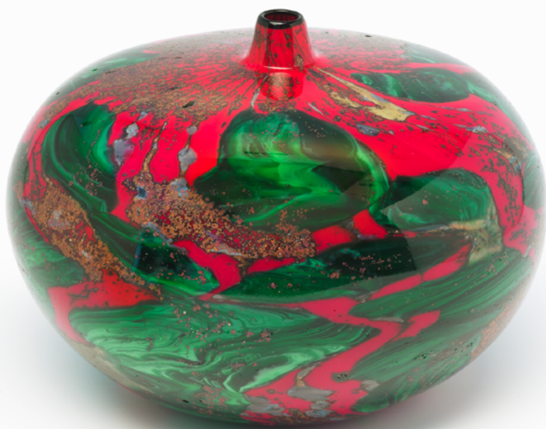
Macchia di Marmo Verde Vase 2000

Polished and ground hand-blown glass canes with murrine and powder inserts 13 x 17 x 17 cm 5.1 x 6.7 x 6.7 in