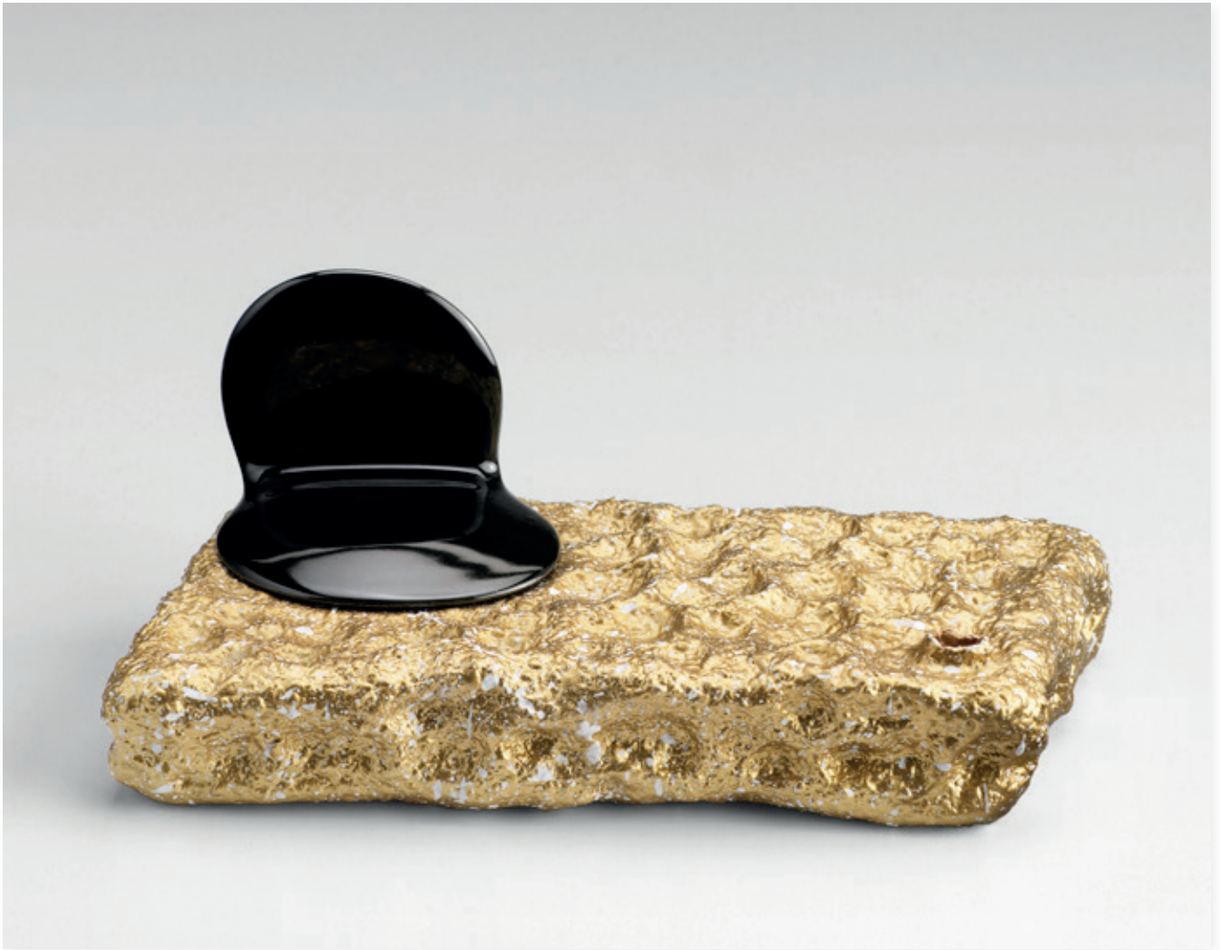
Ron Nagle Sosumo , 2012 mixed media; 7,6 x 17,7 x 8,2 cm / 3 x 7 x 3,3 in Unique