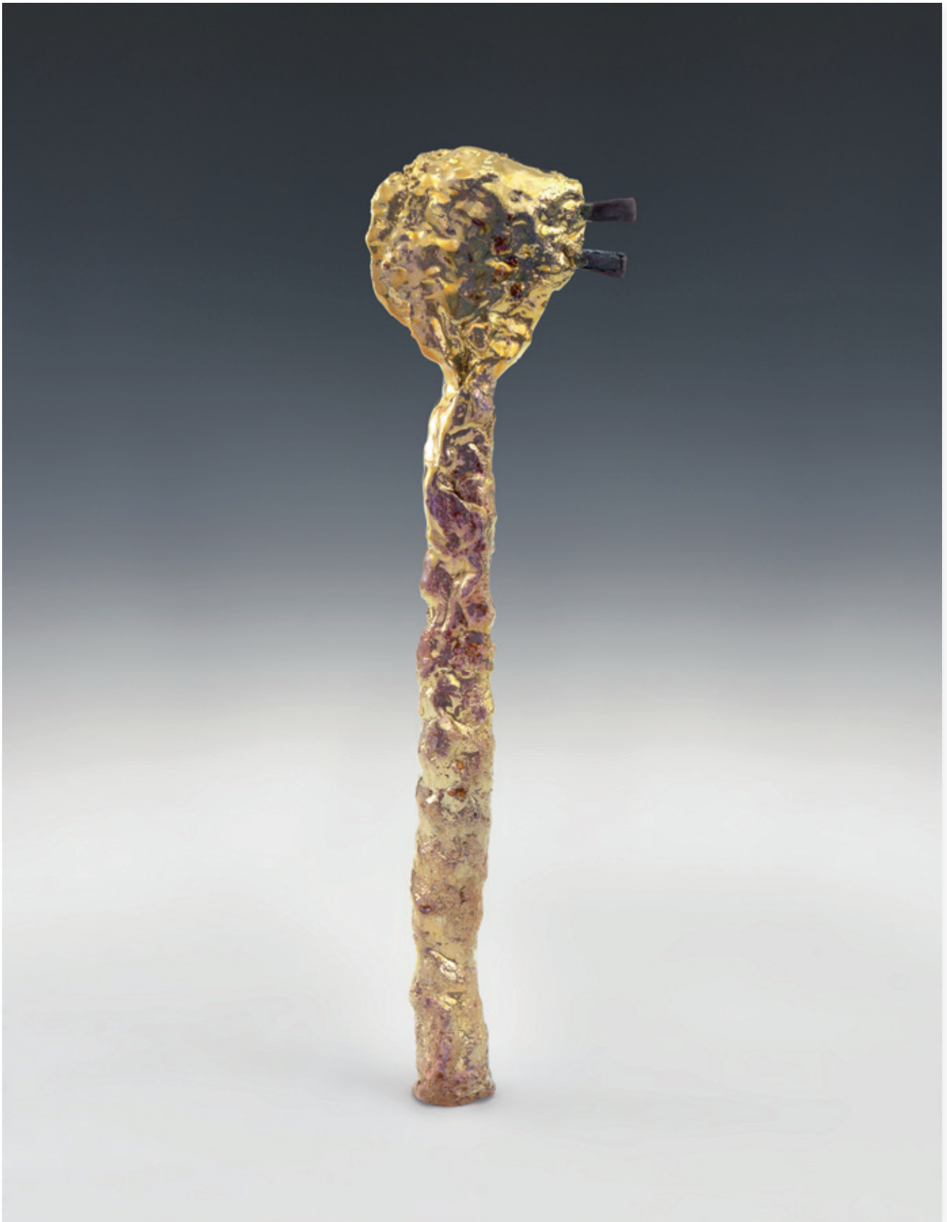
Sterling Ruby CLUB (6842) , 2018

Ceramic, glazes; 53,3 x 14,6 x 5,1 cm / 21 x 5 3/4 x 2 in Unique