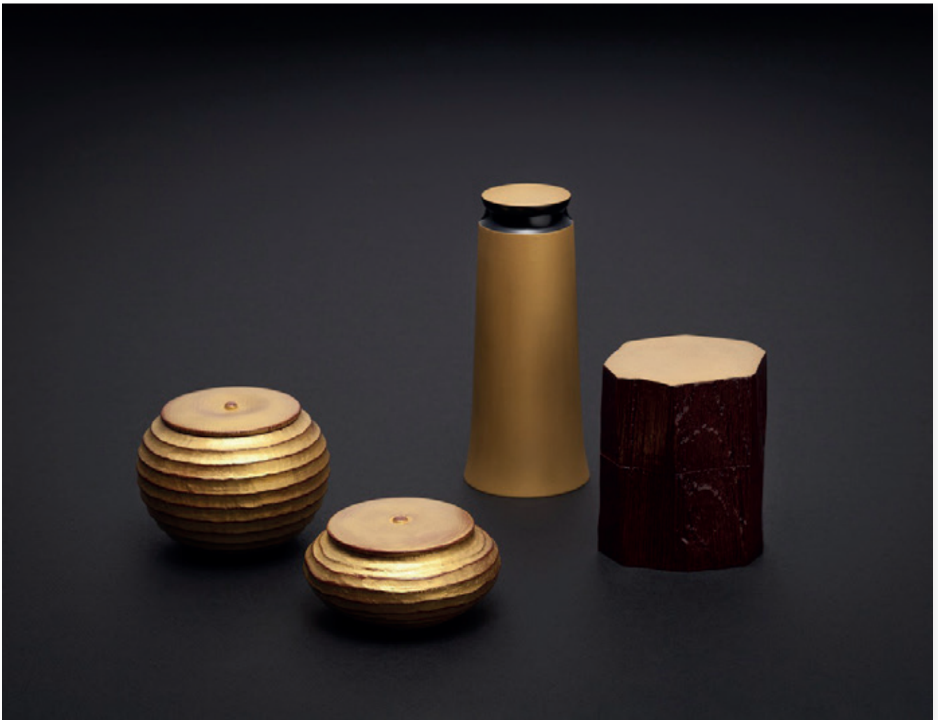
Jihei Murase Untitled , 2017 Lacquered wood, various dimensions Unique