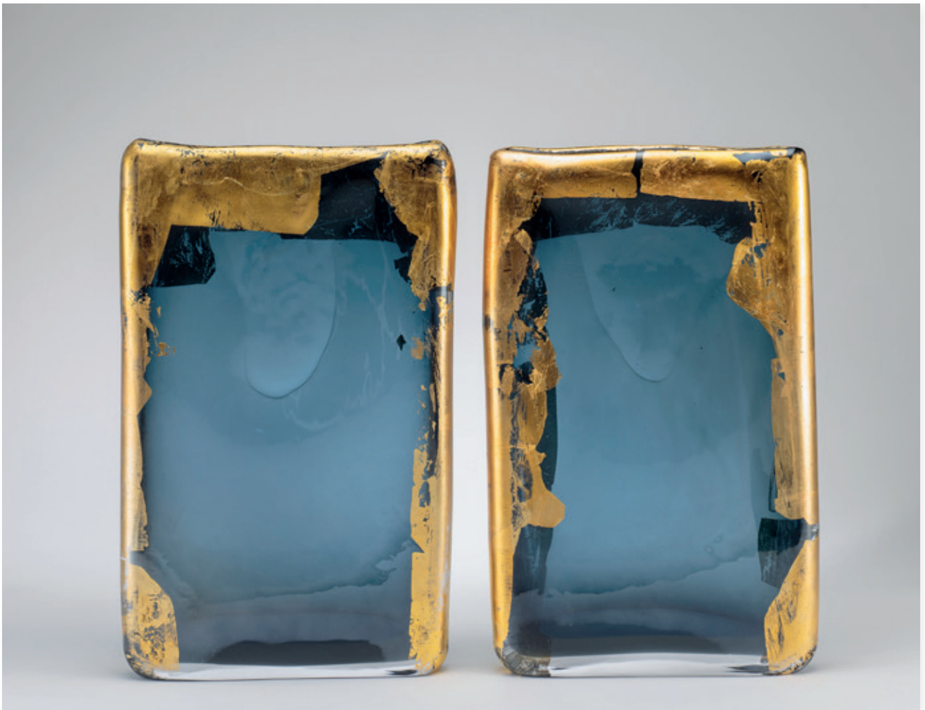
Laura de Santillana Untitled (Jardins) , 2017 Glass, gold leaf; 28,5 x 18 x 3 cm / 11.2 x 7.1 x 1.2 in Unique