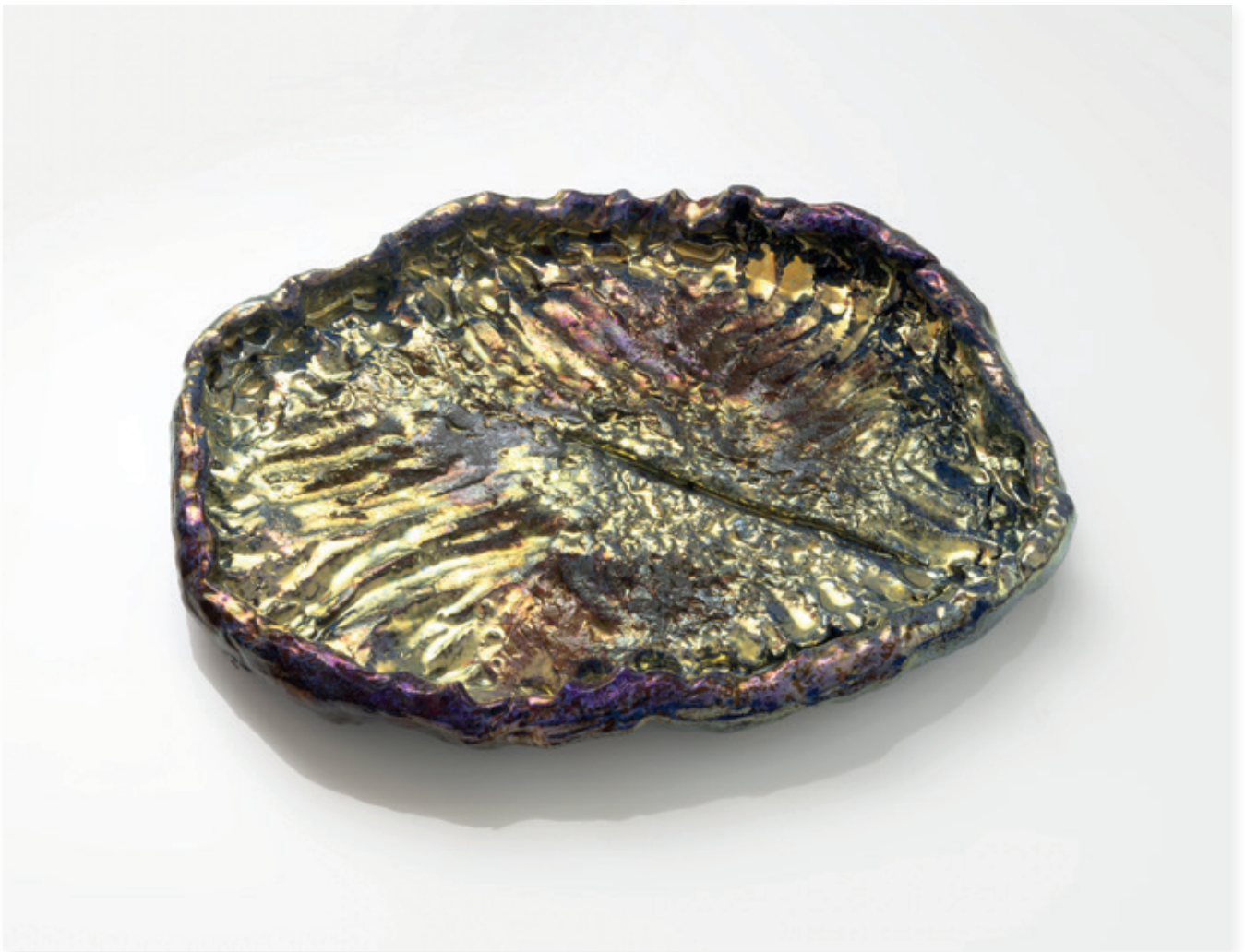
Sterling Ruby Ashtray 478, 2018

Ceramic, glazes, 3,8 x 21,9 x 17,1 cm / 1 1/2 x 8 5/8 x 6 3/4 in Unique