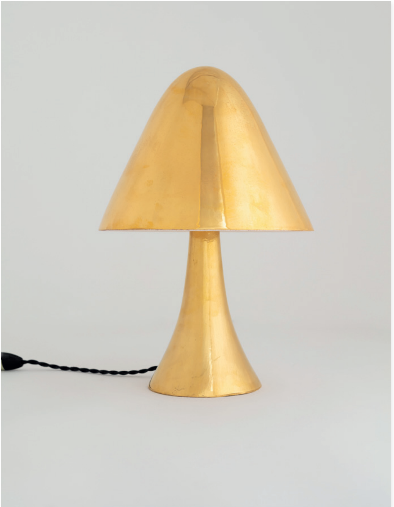
Jos Devriendt Night and Day 150 , 2018 Stoneware, gold enamel; 34 x 23 x 23 cm / 13.4 x 9 x 9 in Unique