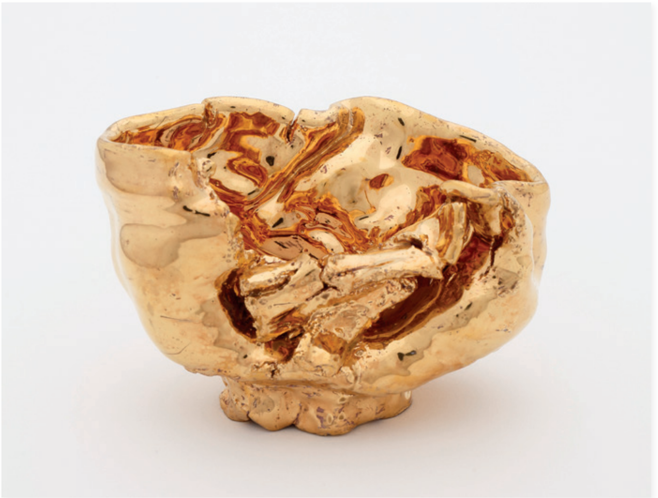
Takuro Kuwata Tea bowl , 2018 Ceramic, glazes, 10,4 x 15,9 x 9,4 cm / 4 x 6.2 x 3.7 in Unique