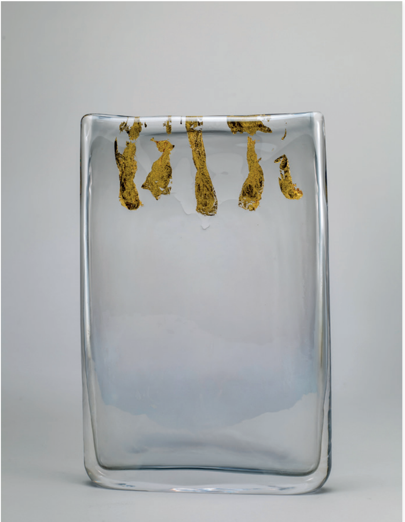
Laura de Santillana Untitled (Etoile) , 2017 Glass, gold leaf; 27 x 18 x 2 cm / 10.6 x 7 x 0.8 in Unique