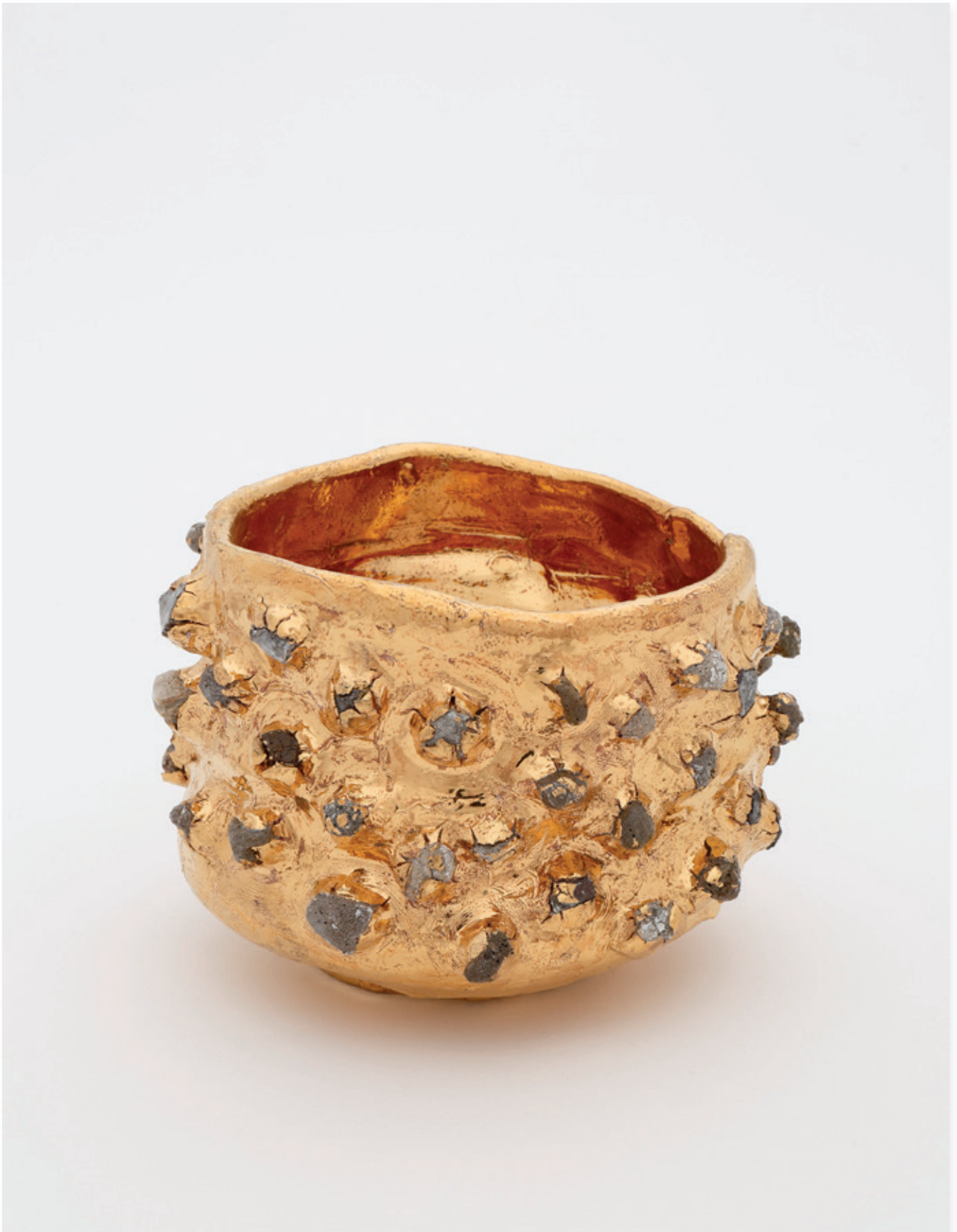
Takuro Kuwata Tea bowl , 2018 Ceramic, glazes; 13,2 x 18,2 x 17,1 cm / 5.2 x 7 x 6.7 in Unique