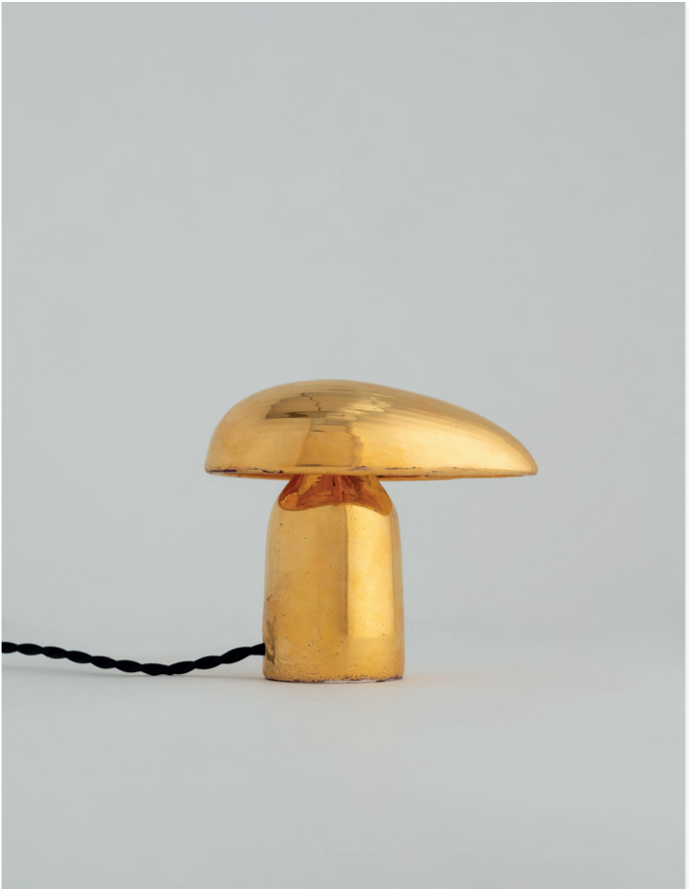
Jos Devriendt Night and Day 151 , 2018 Stoneware, gold enamel; 11 x 8 x 14 cm / 4.3 x 3.1 x 5.5 in Unique