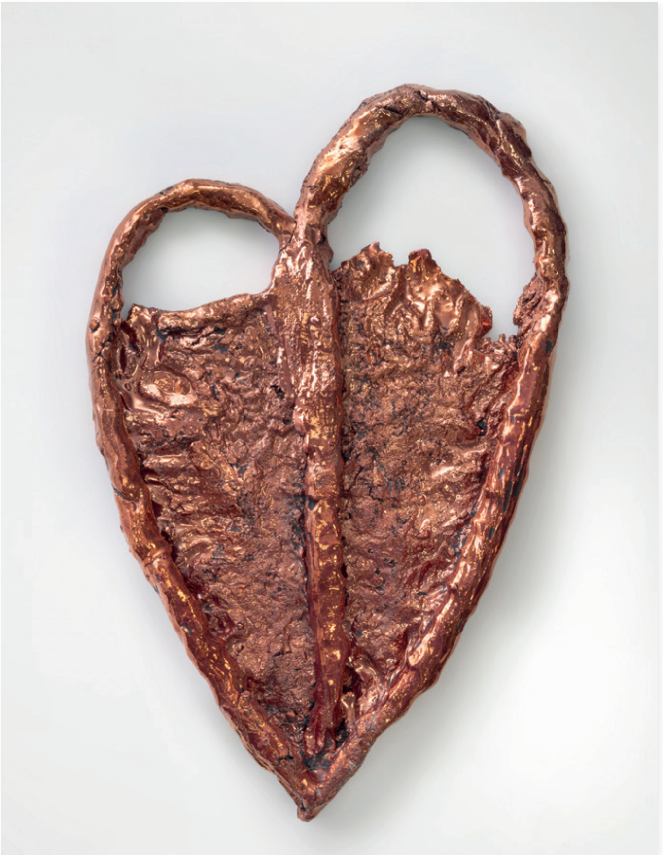
Sterling Ruby HEART (6835), 2018

Ceramic, glazes; 55,2 x 35,9 x 4,1 cm / 21 3/4 x 14 1/8 x 1 5/8 in