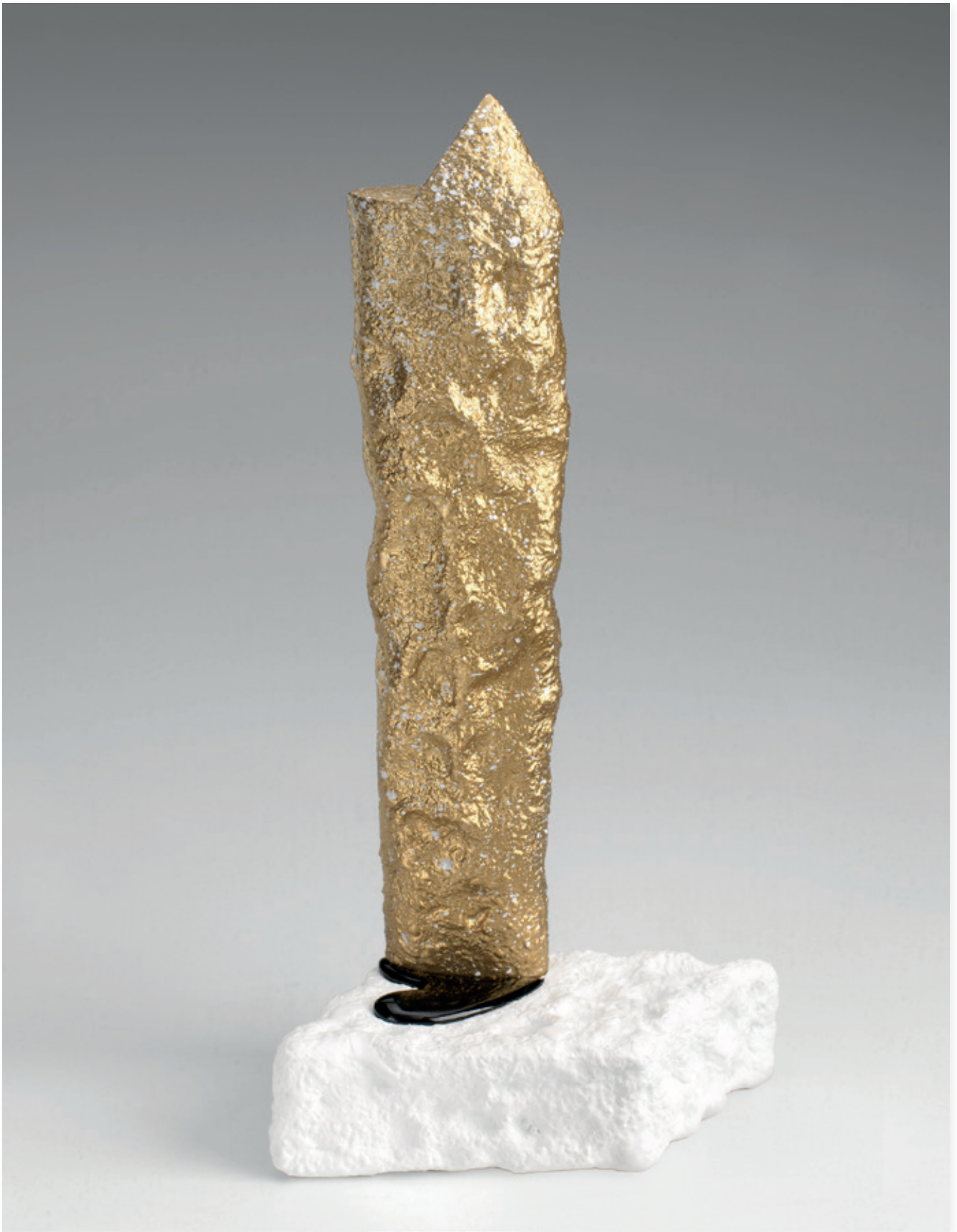
Ron Nagle Babe Magnate , 2012 Mixed media; 26 x 13,3 x 6,9 cm / 10,3 x 5,3 x 2,8 in Unique